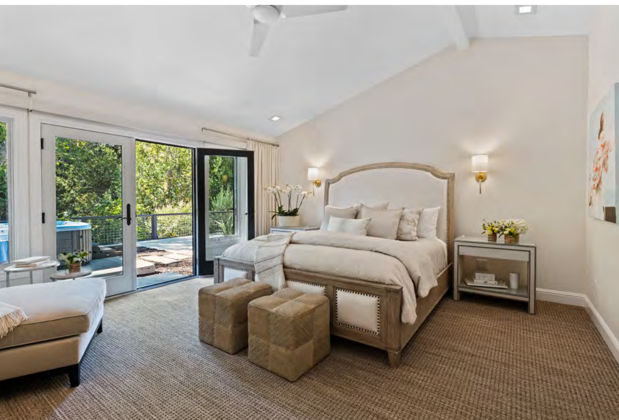
Top: A Worlds Away entry table complements an existing mirror; Bottom: The master bedroom opens up to a sanctuary surrounded by lush trees.